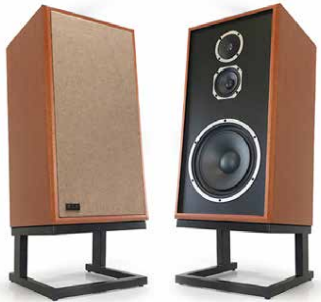
Shown in West African Mahogany SKU#: KLHF00060

Stonewash Linen Grille available by special order Basalt Black Knit Grille available by special order