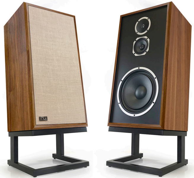
Shown in English Walnut

Basalt Black Knit Grille available by special order