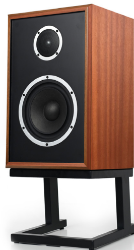
Shown in West African Mahogany