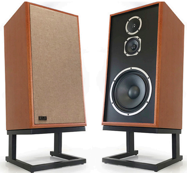
Shown in West African Mahogany

Basalt Black Knit Grille available by special order